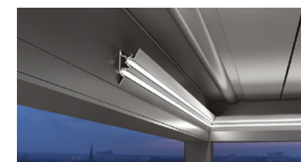
Dimmable LED lights applied on transoms and louvers, providing sufficient and stylish lighting at night.