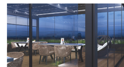
Integrated glass partition system, creating pleasant spaces full of natural light, with controllable environmental conditions.